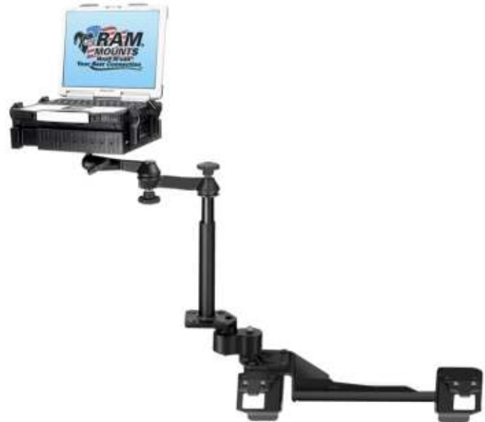
Shown In Use RAM-VB-182-SW1

Low profile minimized intrusion into passenger leg space